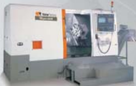
Vturn-36W for wheel turning