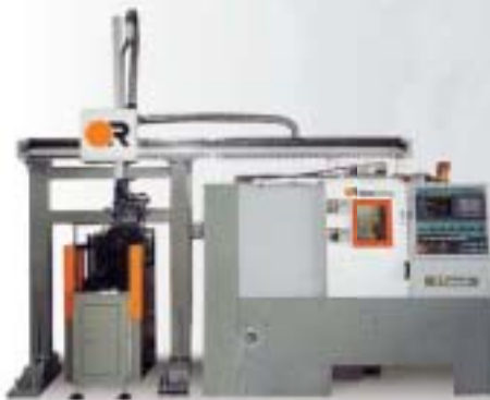
VTplus-20 with gantry robot