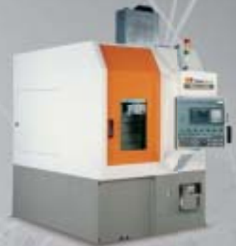
Vturn-V300 vertical lathe